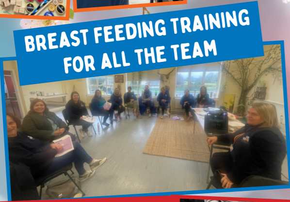
BREAST FEEDING TRAINING FOR ALL THE TEAM