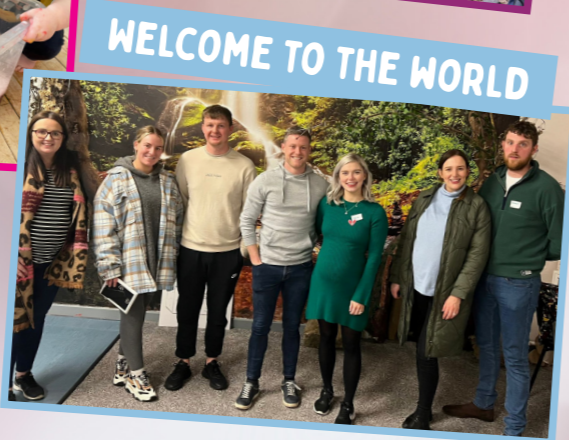
WELCOME TO THE WORLD