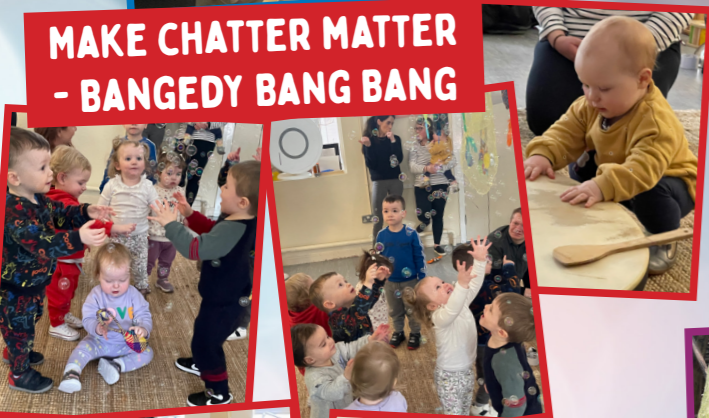
MAKE CHATTER MATTER - BANGEDY BANG BANG