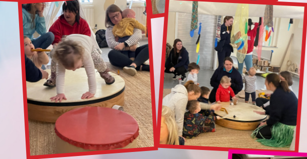
MOTHER'S DAY EVENT